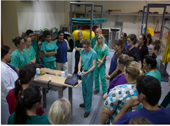
Figure 1. Image of the Bandage Laboratory Instruction.

and the skeleton is filled with soft urethane foam. This foam simulates the soft tissue around the limb in order to maintain normal limb shape. The proximal medial aspects of both the hind and fore limbs have an external threaded female mounting sleeve. This sleeve allows the limb model to be firmly attached to a one-inch thick mounting board through use of a two-inch long 3/8-inch hex head bolt. The area in which the bolt penetrates through the mounting board has been counter sunk to allow the board to rest flat on an examination table. The mounting board is one-foot wide by three feet long. The mounting board is secured to the end of a stainless steel examination table by eight inch "C" clamps placed at each end of the board. This type of attachment prevents the model from sliding during bandage placement. It also allows access to the entire circumference and joints of the model to facilitate bandage placement (Figure 2).