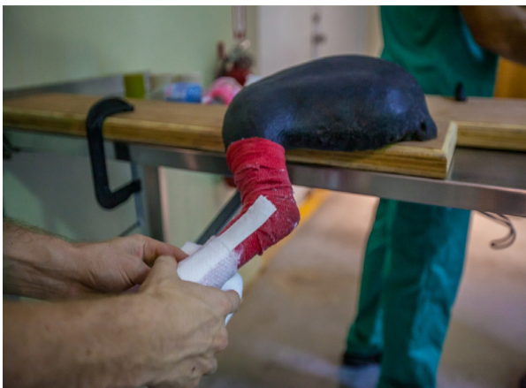
Figure 2. Image of Hind Limb Model.

A total of eight small animal clinical faculty members were invited and accepted to participate in the study. These faculty members were selected based on their experience in small animal bandaging given their clinical backgrounds and prac-